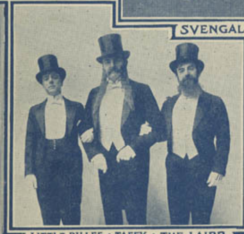
LITTLE BILLEE • TAFFY • THE LAIRD