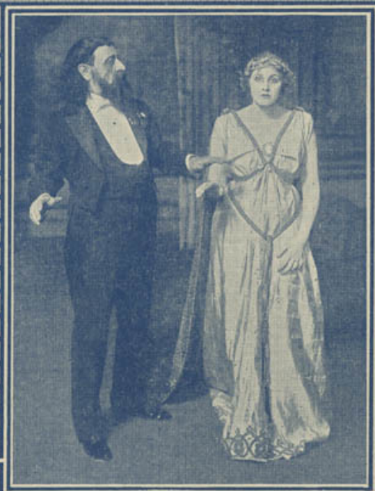
SVENGALI & TRILBY