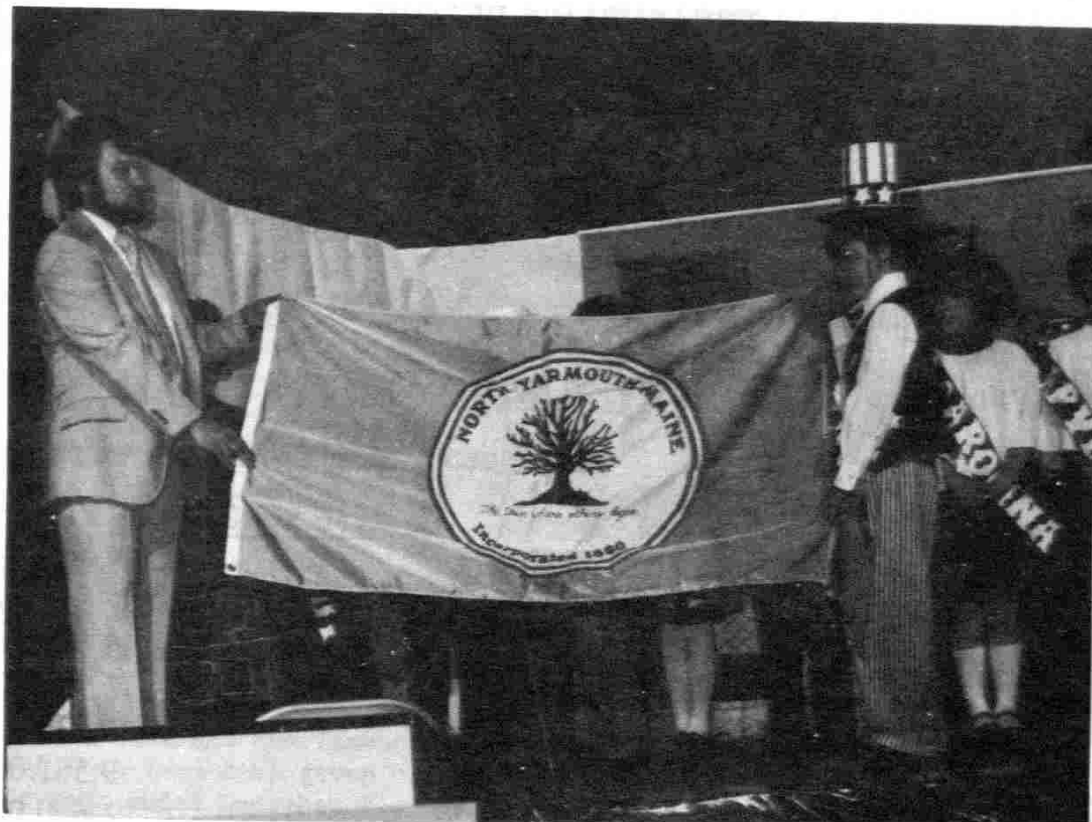
“Salute to America” North Yarmouth Memorial School 1980