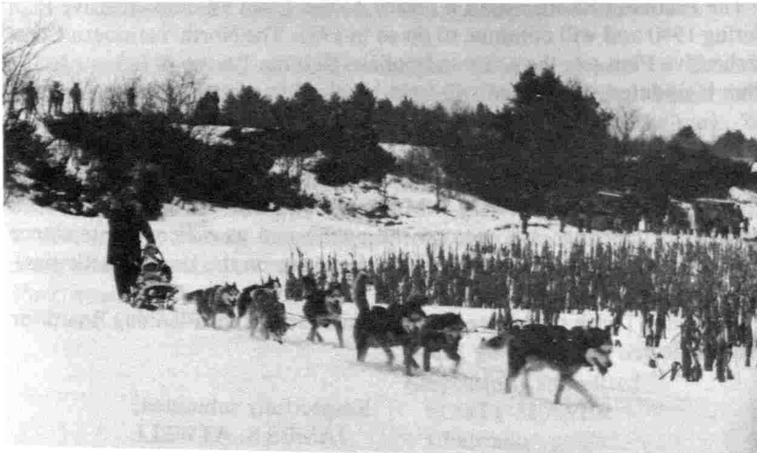
“Winter Festival” 1980

The annual town-wide litter drive was particularly important in the 1980 Tricentennial Year. Road captains for every road in the town were responsible for their own volunteers. The clean-up weekend was April 18, 19, and 20. Ten small cash prize coupons were hidden in jars, and placed randomly along the roadside to lend a festive air to the traditional spring chore. Everyone agreed the roadsides had not been as clean in the last 300 years and the new manner of organization was fun as well as effective. In addition, the Conservation Commission arranged for the Tree Warden to thin trees in the Town Park in preparation for the Tricentennial, and a better growth management.