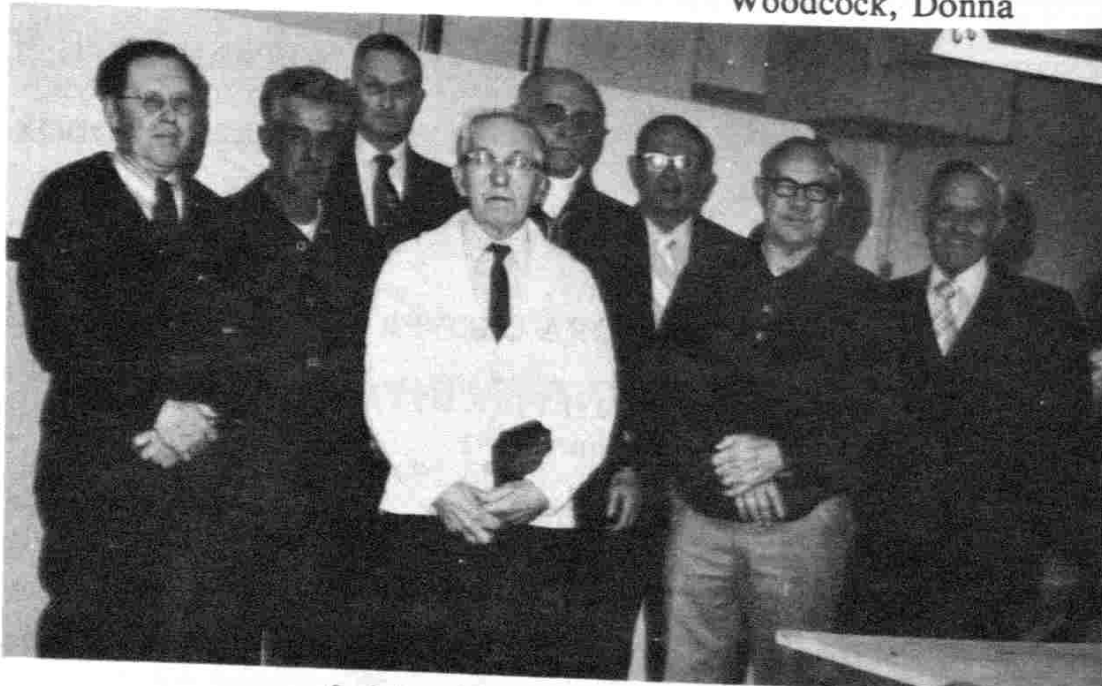
8 of the original 21 Charter Members of the North Yarmouth Fire Department. "Old Timers Night, March 30, 1980"