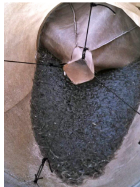
( http://www.downeastfisheriestrail.org/wp-content/uploads/2014/11/AngelaYoung_fyke_net_eels_now.png ) View of the inside of a fyke net full of glass eels.

The timing of the glass eel migration depends on water temperature. The earliest glass eels enter Maine's coastal waters shortly after the ice thaws each spring. Early in the commercial season the eels are usually more abundant in southern coastal Maine than in Downeast Maine because the coastal waters of Downeast Maine are usually slower to thaw than those farther south. Many glass eel fishermen move from river to river during the fishing season to target the eels where they are most abundant. In a recent interview, Darrell Young, a glass eel fisherman from Eastbrook, Maine, explained how harvesters follow the eels: “We start out in the little brooks and we end up in the big