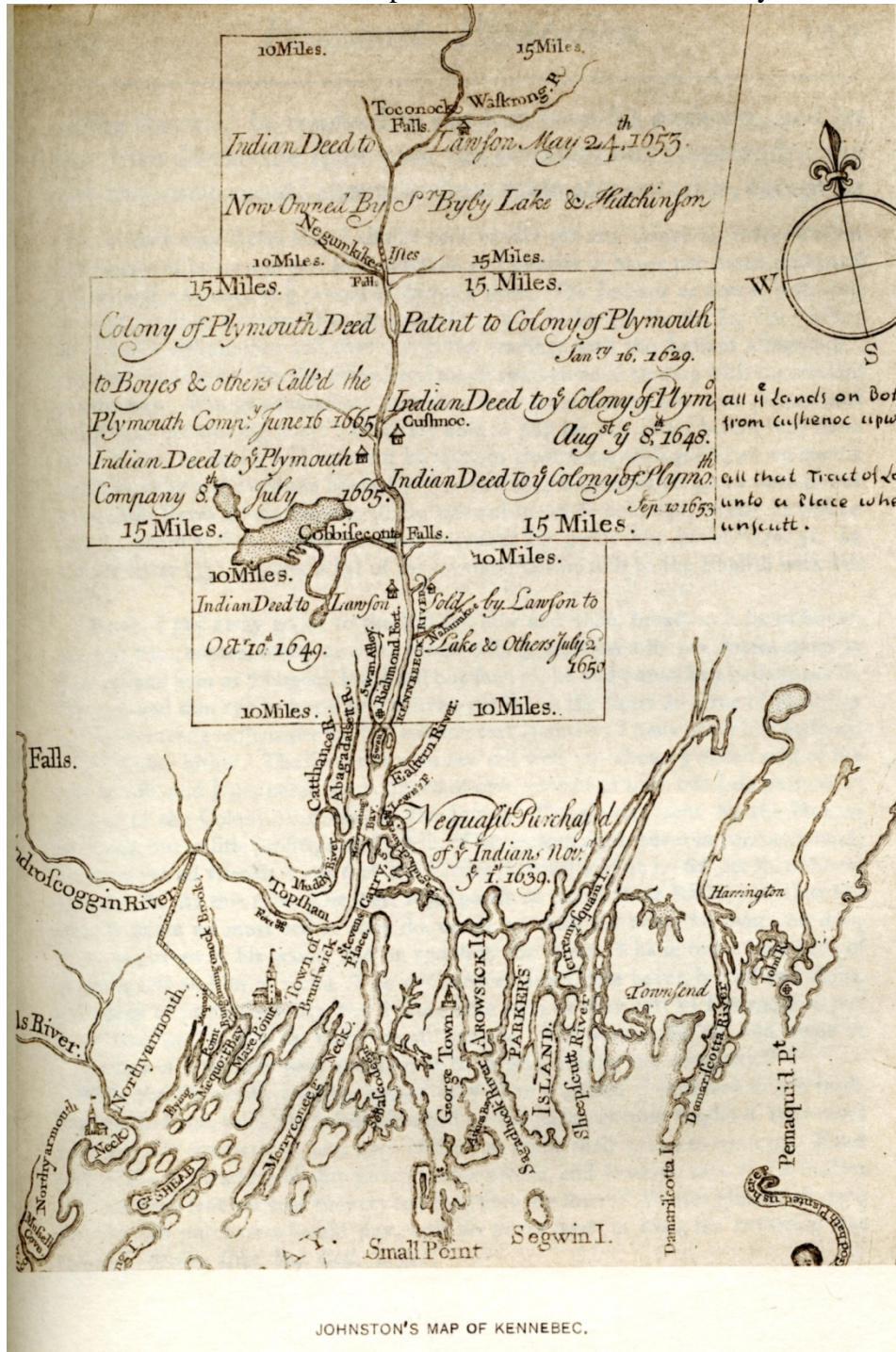
JOHNSTON'S MAP OF KENNEBEC.