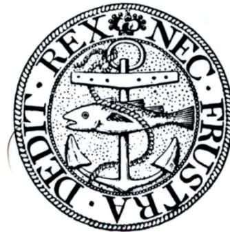
SEAL OF PROPRIETORS KENNEBEC PURCHASE