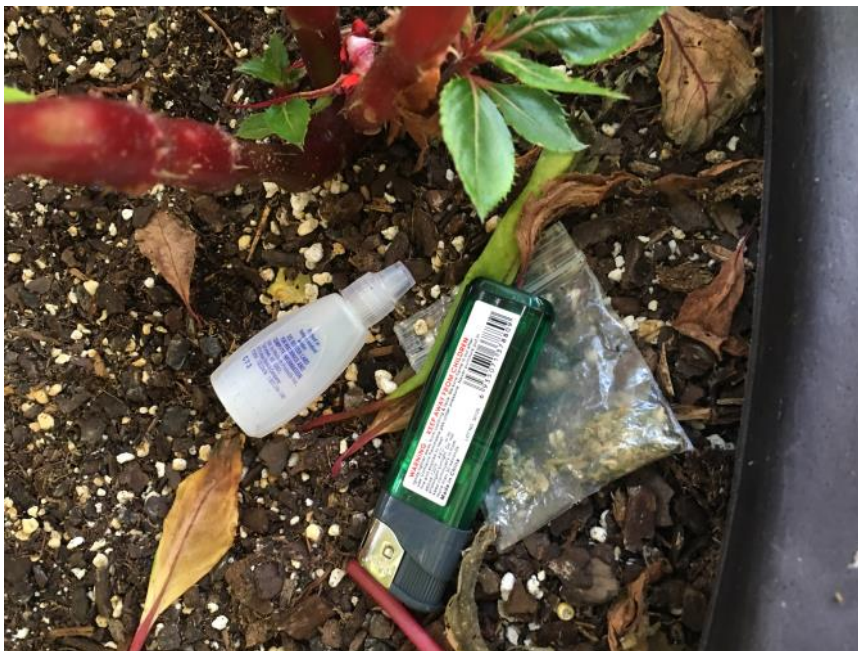
Figure 2. A marijuana smoker's cache, illustrating the importance of preparing for the unexpected.

Another aspect of sampling that needs to be addressed is what material is to be collected. In our surface collections, the vast majority of items encountered were cigarette butts, but cigarette packaging, plastic cigar mouthpieces, and more ambiguous items such as lighters were encountered. It is also a good idea to discuss illicit items that may be discovered and what to do in such instances (Figure 2). It is also necessary for students to start planning for curation and data storage at this point of the activity. Thus, this stage of the process is critical to addressing Wilk and Schiffer's (1981) second point that students be more involved in generating questions/hypotheses as well as methods to test them.