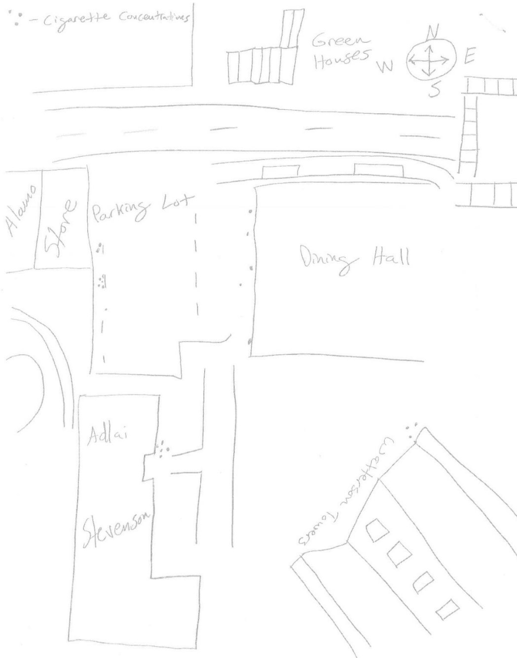
Figure 4. Example of a student map drawn while conducting his survey of cigarette butts on campus. Drawing courtesy of Sam Smedley.