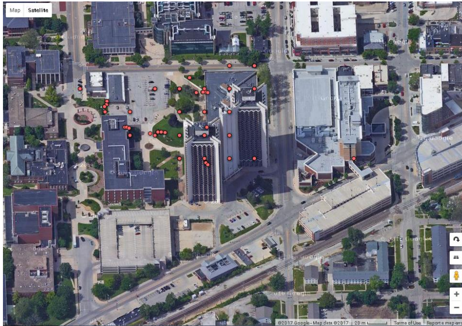
Figure 1: Example of data points that fall into in a grid-like pattern. This pattern is due to insufficient data accuracy and does not accurately reflect the archaeological record of cigarette butt disposal.